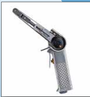
SI - 2700

Our belt sanders are also ideal for deburring of all kinds and are a sensible and economical supplement for all grinding work.