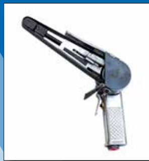
SI - 2800